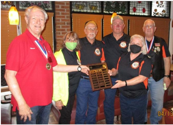
Capturing the East TN Traveling Plaque