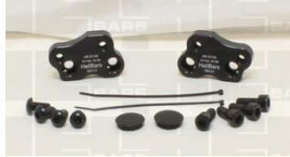
HeliBars Tour Performance handlebar risers for 2018+ Honda GL1800. Very-good condition, only used a short time (replaced with the Helibars Handlebar system), MSRP $129.00, asking $75/OBO