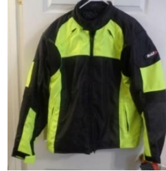
Bilt Spirit H2O jacket, lady's size large, brand new, MSRP $299.99, asking $50.