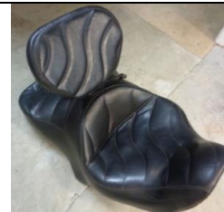
Hartco custom heated vinyl seat, with rider backrest, matching co-rider backrest cover, new heating element and refreshed rider's seat foam done by Hartco, fits GL1800 2012-2017, original MSRP $1,500, asking $400.00/OBO