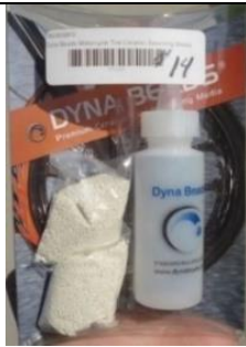
Dyna Beads for tire balancing, new, (with TPMS system in our bike, we can't use these), asking $10