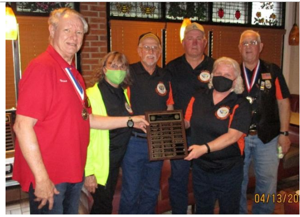
Capturing the East TN Traveling Plaque