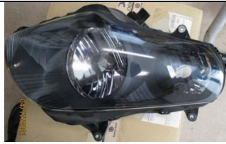
Honda 2012 Gold Wing headlight assemblies, left & right, asking $200 for both.